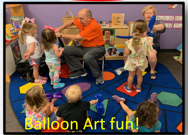
Balloon Art fun!

Heathrow Christian Academy at Markham Woods Presbyterian Church